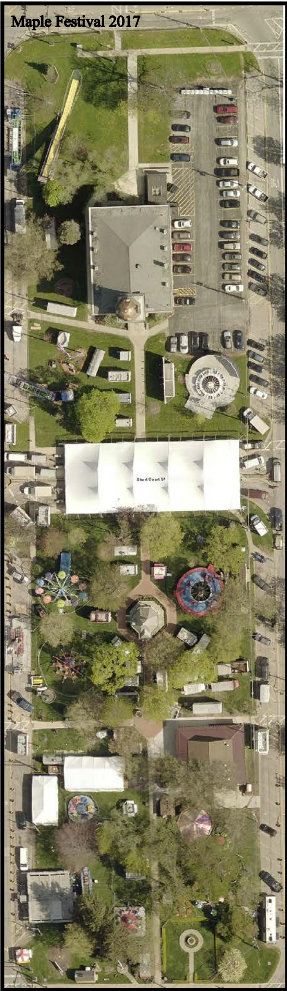
Maple Festival 2017